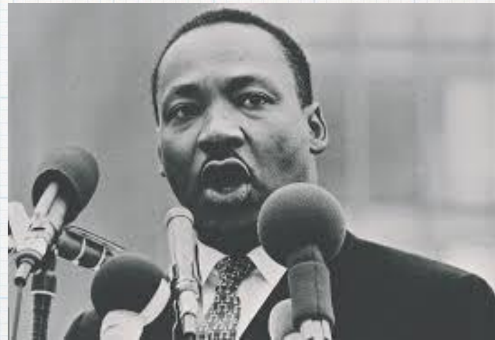
Martin Luther King Jnr

Well, you may go on and live to 90, but you’re as dead at 38 as you would be at 90. And the cessation of breathing in your life is but the belated announcement of an earlier death of the spirit”